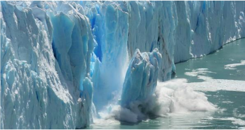
Melting glaciers are one of the most visible effects of climate change.